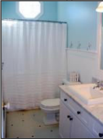
2 Full baths on upper level