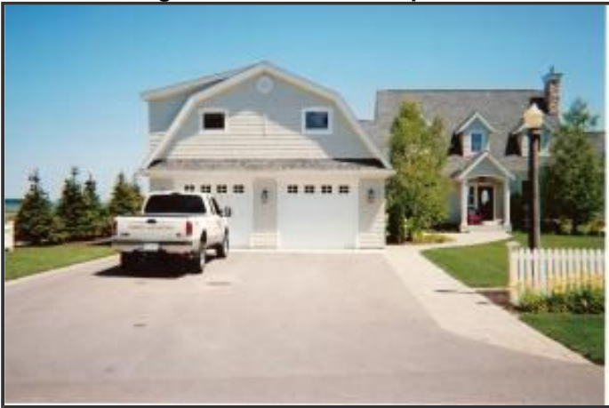
Garage has finished 1 BR apartment