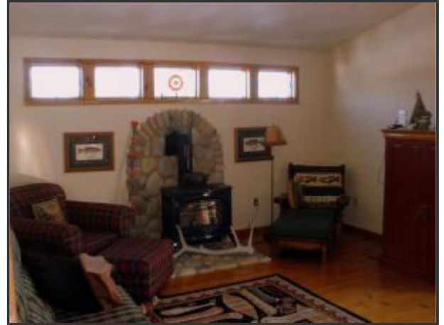
Garage Apartment: Living Room