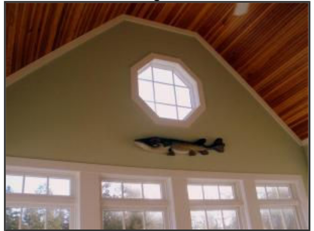
Vaulted ceiling in Sun Room