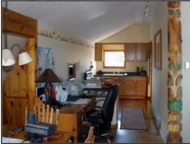
Garage Apartment:: Kitchen and Living Rm