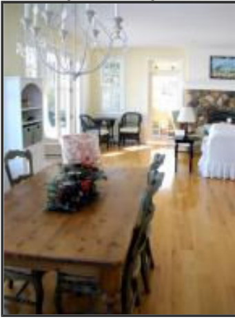
Open floor plan