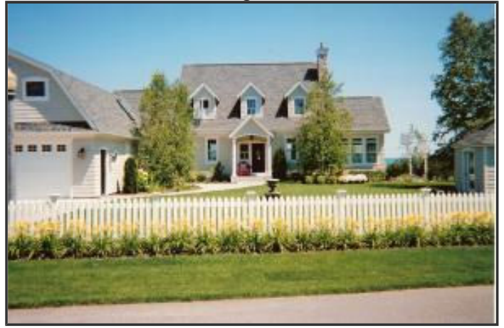
Home facing Shore Drive