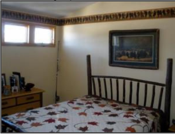
Garage Apartment: Bedroom