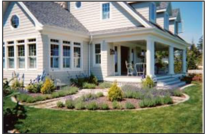
Sit and relax on the covered veranda