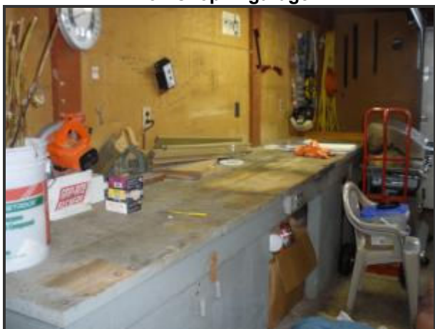
Workshop in garage