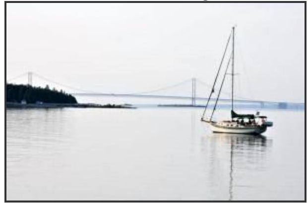
Sailboat and Bridge