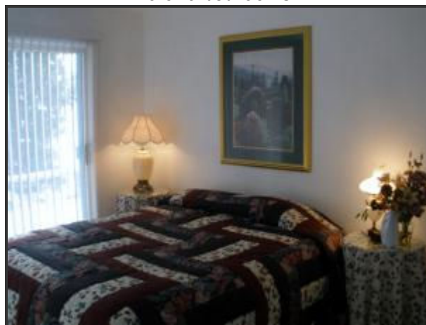
3 of 3 bedrooms