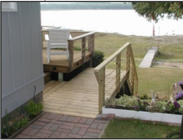
Steps to back deck and Lake MI