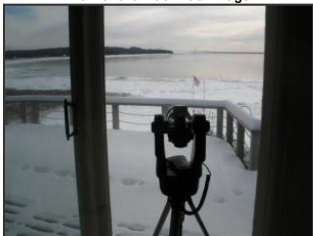
View of the Mackinac Bridge