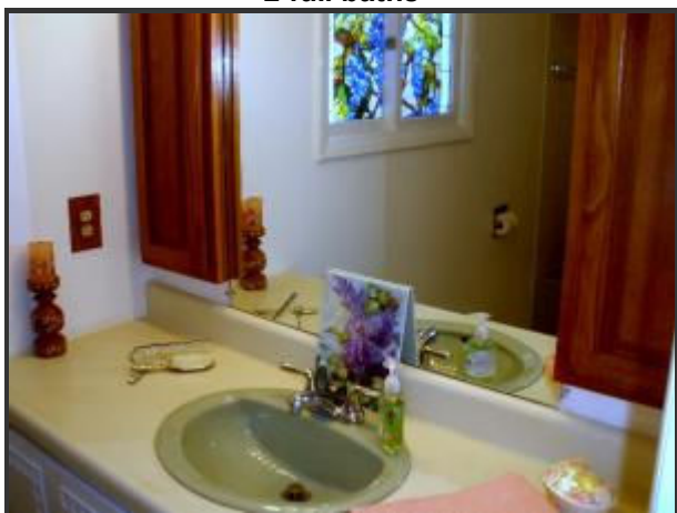
2 full baths