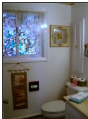
1 of 2 full baths